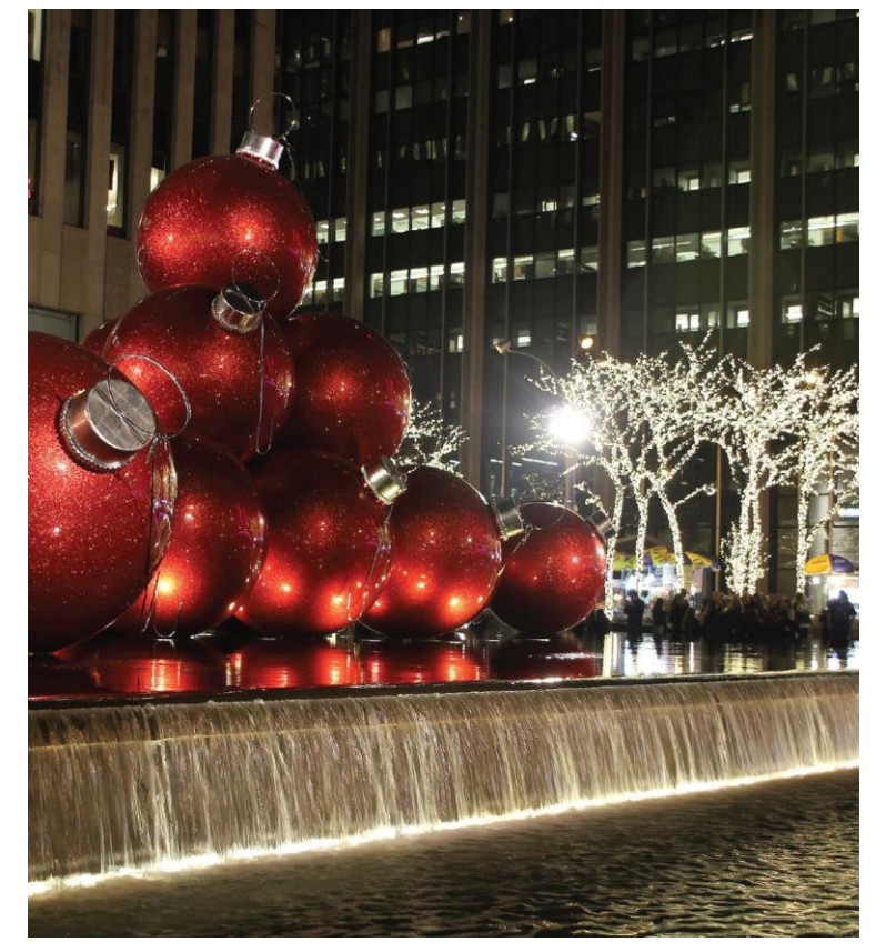
5 Days ● 5 Meals : 3 Breakfasts, 2 Dinners

HIGHLIGHTS... Greenwich Village, Wall Street, Christmas Spectacular at Radio City Music Hall, Statue of Liberty, Ellis Island, 9/11 Memorial, 9/11 Museum, Broadway Show